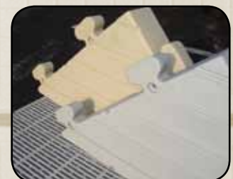
Other colors available upon special request.